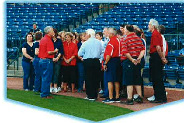
Celebration Choir at MS Braves